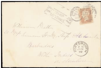
Lot 798, 1880 Envelope addressed to "William Pratt", Sold for £11,500