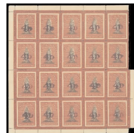
Lot 2107, Toned Paper, a complete sheet of twenty with showing long tailed 's', Sold for £5,980