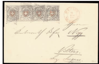
Lot 2505, 1850 'Orts-Post' unframed cross 2 1/2 Rp. strip of four, Sold for £10,580