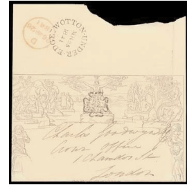
Lot 824, 1d. letter sheet, A234, addressed to "Charles Goodwyn esq." Sold for £16,100