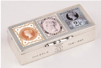
Lot 507, 1891 London, Superb triple compartment box by George Heath, Sold for £17,250