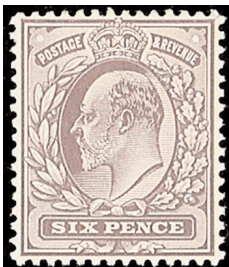
Lot 1250, 6d. bright magenta, unmounted mint, Sold for £9,200